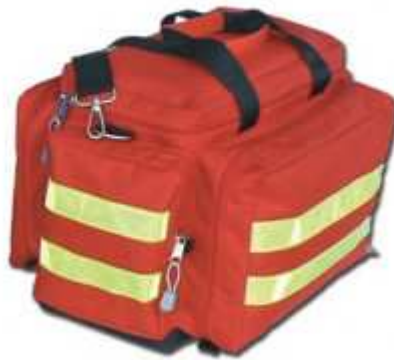
Figure 1: Code: 27150