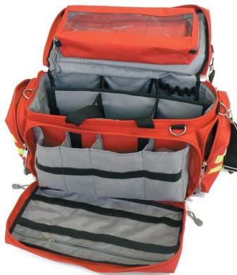
Figure 2: Code: 27151