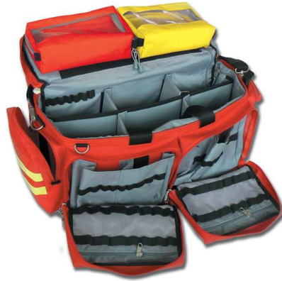
Figure 3: Code 27153