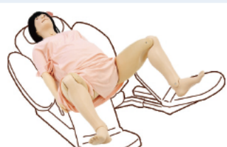
Compatible with birthing chairs