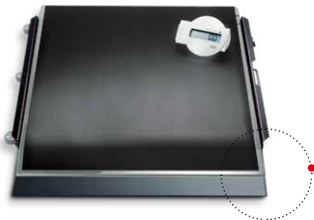
A ramp for easy roll-on of wheelchair is included in delivery.