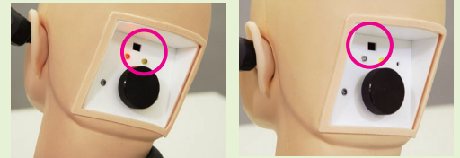
Alarm indicating painful insertion