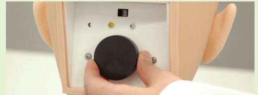
Quick switch between cases