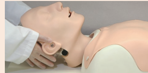
Neck Flexibility (Life-like jaw movement)