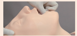
Mouth Opening - Normal - Intermediate - Difficult