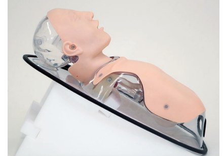
The manikin can be set in Fowler's position.