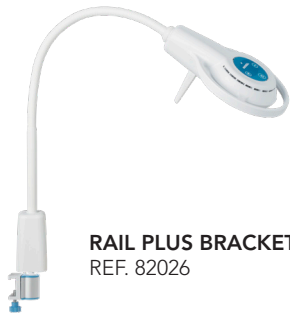
RAIL PLUS BRACKET REF. 82026