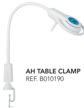
AH TABLE CLAMP REF. B010190