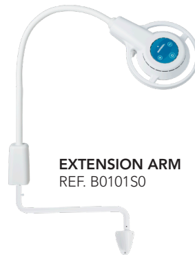
EXTENSION ARM REF. B0101S0