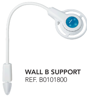
WALL B SUPPORT REF. B0101800