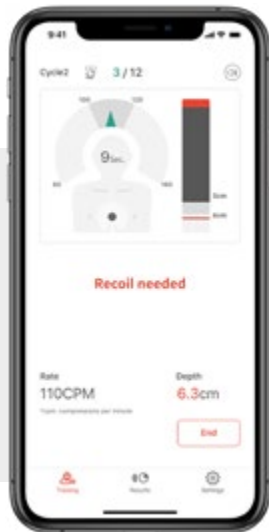
Intuitive Student Feedback App monitors and analyses performance improvement