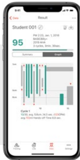
Student's results can be saved and offer a complete debriefing functionality