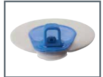
A = 4 mm fitting