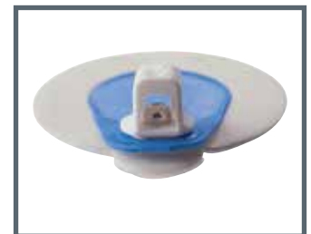
F = 3 mm fitting