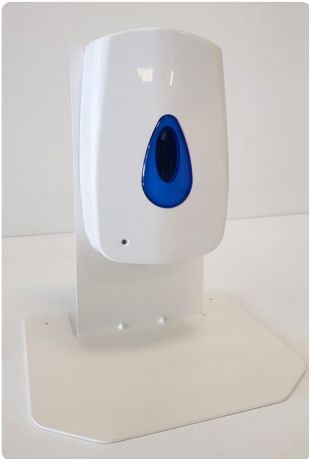
TABLE TOP STAND WITH TOUCH FREE DISPENSER

Free standing table top station making hand sanitiser available anywhere. Great for hospitals, surgeries, supermarkets and places with high traffic areas. For use with Brightwell Dispensers Modular touch free dispenser. Promotes good hand hygiene and makes it easy to keep hands sanitised in any facility.