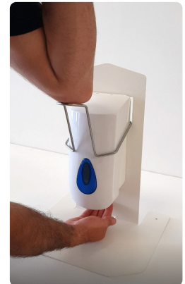
MANUAL DISPENSER Activate dispenser with elbow lever