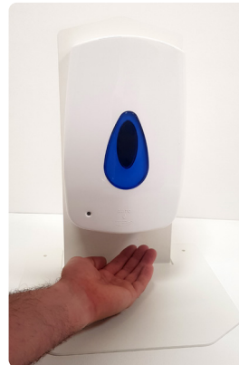
TOUCH FREE DISPENSER Touch free activation of dispenser