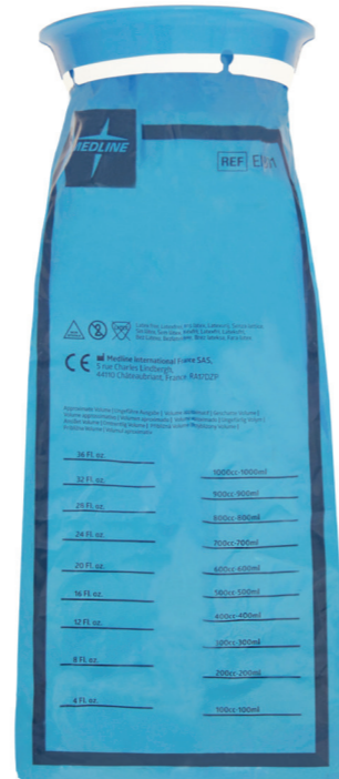
Blue emesis bag EMB01