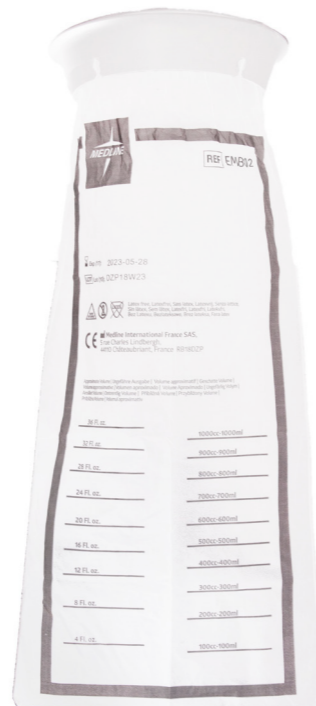
Clear emesis bag EMB02