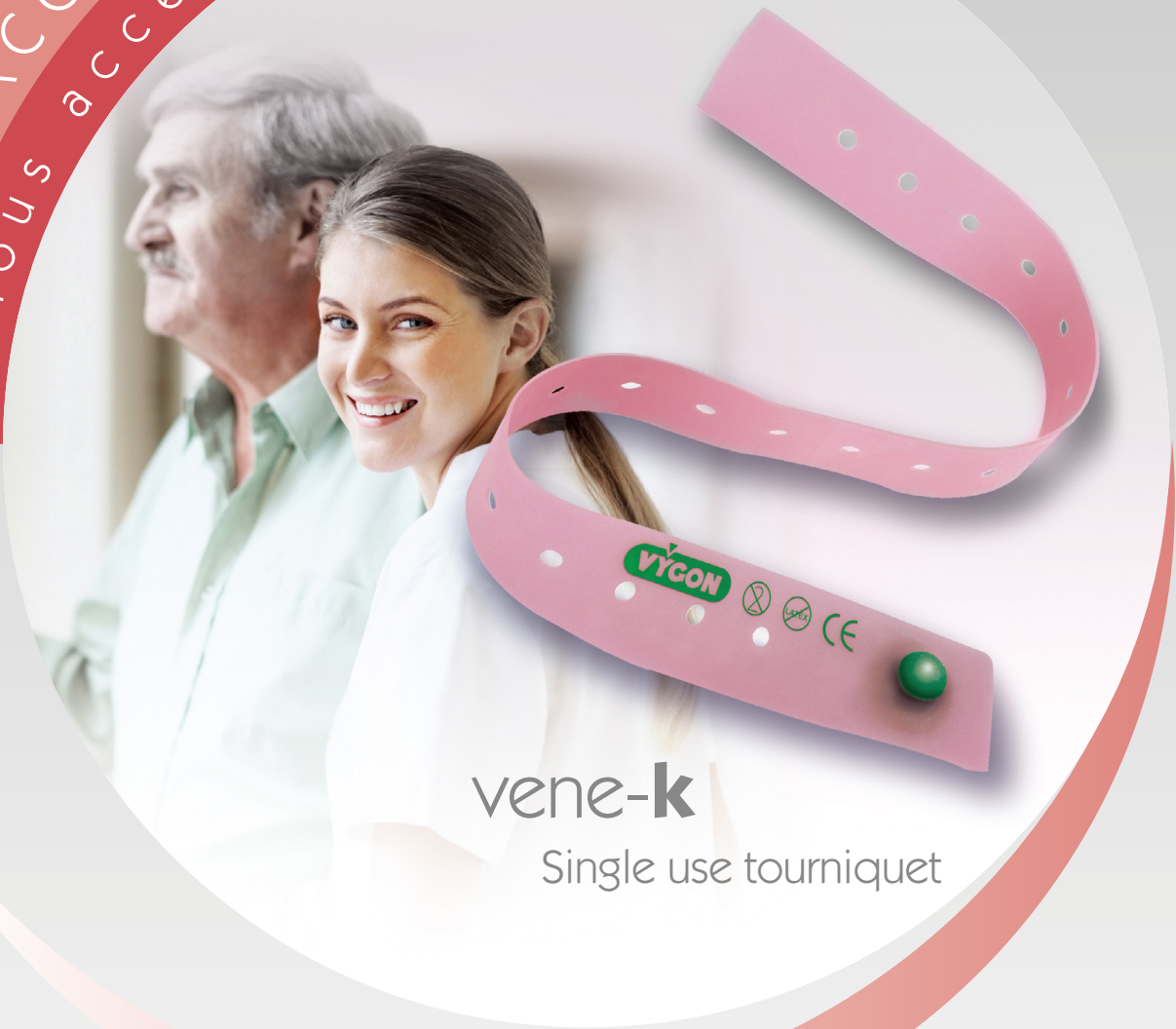
vene-k Single use tourniquet