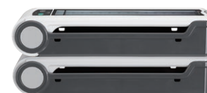
Flat base for stacking multiple units