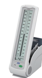
B-type Stand-alone use