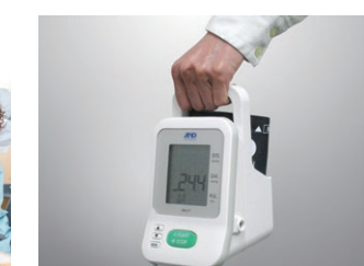
Easy to carry