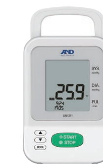
Stand-by display (Room temperature)