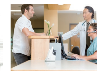
Stored and charged at nurse station