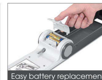
Easy battery replacement