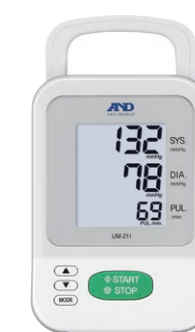
Measurement display (with backlight)