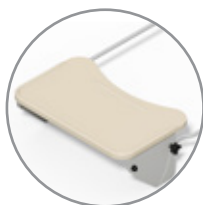
Tilting Patient Table