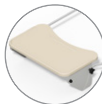
Tilting Patient Table