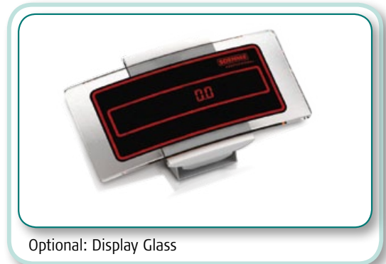
Optional: Display Glass