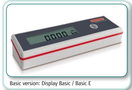
Basic version: Display Basic / Basic E