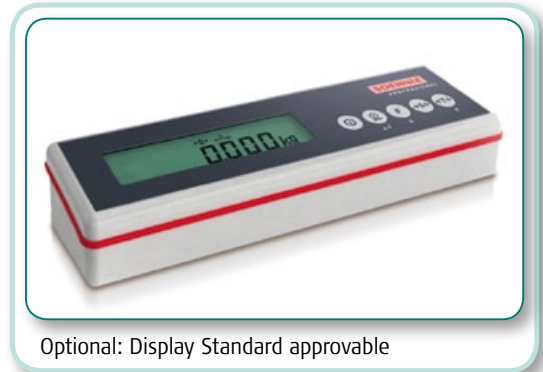
Optional: Display Standard approveable